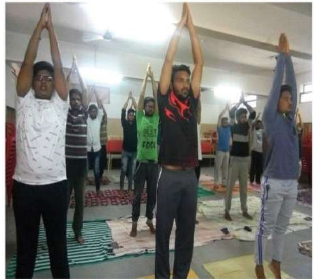
Students Performing YOGA